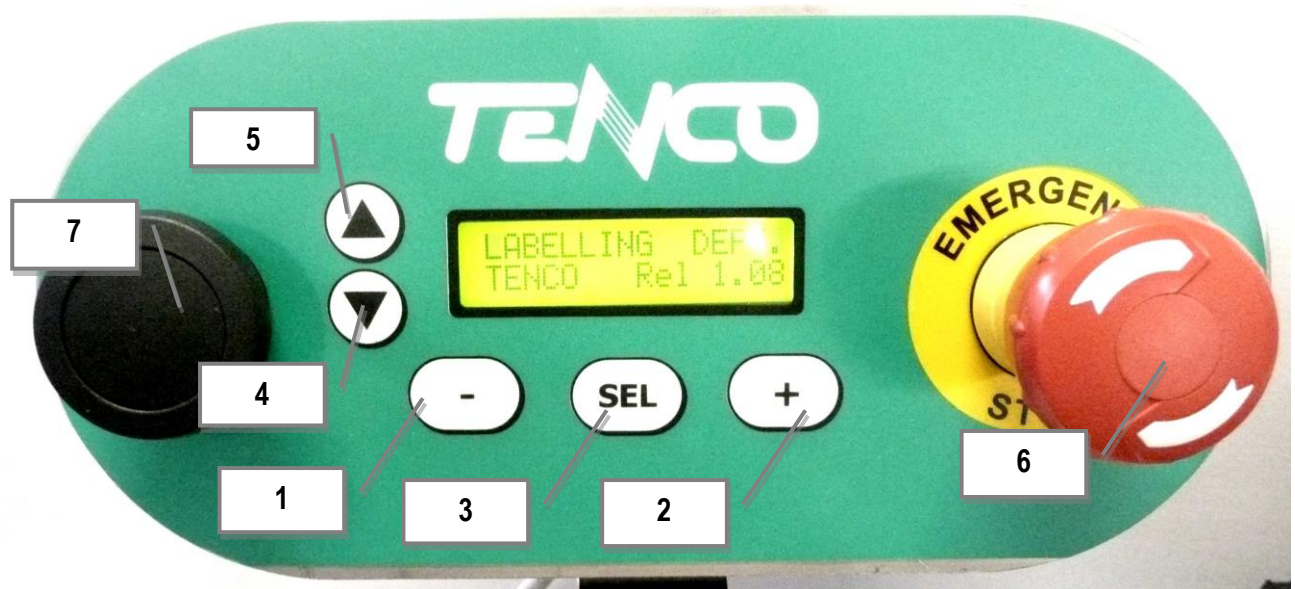
Picture 1 Display